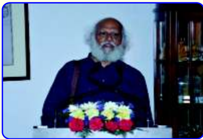
Mr Jatin Das, Renowned Painter