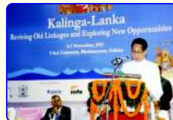
Mr S.C. Jamir, Hon'ble Governor of Odisha