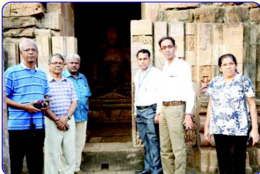
Delegates at the Sanctum of Ratnagiri Buddhist Heritage site

Ratnagiri comprises two magnificent monasteries, one of them was double-storied and had an extensive stone paved central courtyard with two-sides of it having a number of cells for habitation of monks. The sanctum enshrines a massive seated Buddha in bhumisparsa-mudra flanked by the standing figures of Padmapani and Vajrapani holding chamaras on each side.