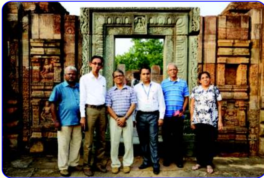
Scholars of Sri Lanka and Odisha at the entrance of 5 th century A.D. Ratnagiri Mahavihara, the prominent Buddhist heritage site of ancient Kalinga

The finest relic of Buddhist art at Ratnagiri is a magnificent doorjamb adorning Monastery 1, one of the two monasteries here. The exquisitely carved chlorite doorframe with gaja-lakshmi on the lintel and the bands of floral, creepers and Gelabai motifs is unique of its kind and marks the highest watermark of decorative art of India.