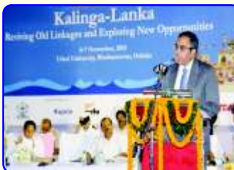
Mr Esala Weerakoon, Hon'ble High Commissioner of Sri Lanka