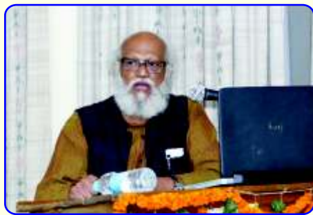
Shri Jatin Das, eminent painter & Chairman, JD Centre for Art, Bhubaneswar