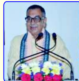
Shri K.P. Singh Deo, Former Parliamentarian and Union Minister of India