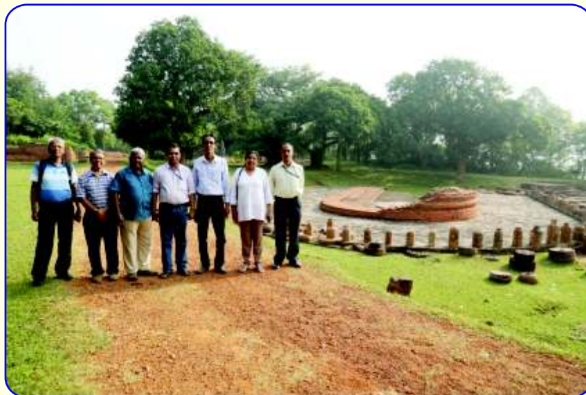
Delegates at the Lalitgiri Buddhist Heritage site