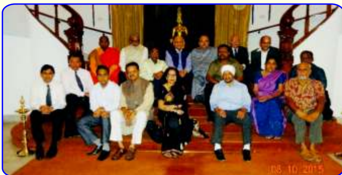
Get-together of KLF Members at the High Commission