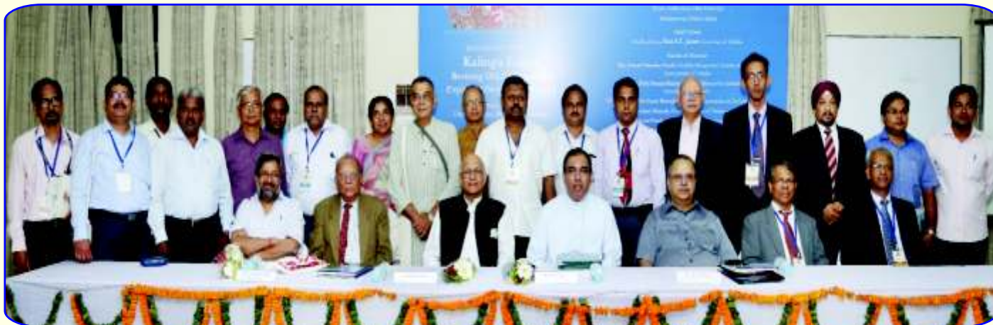
The Kalinga Lanka Connect: Final photo-frame of the Seminar –Promoting people to people contact