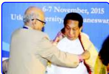
Felicitation of Governor of Odisha by President of Kalinga Lanka Foundation

Hence, the focus of the aforesaid academic-cum-business seminar was to develop awareness and activate an age-old relationship between Sri Lanka and India through fresh initiatives in the field of education, art, culture, Buddhist pilgrimage, tourism, skill developments, joint ventures and commerce. The 2-days long seminar comprised of six sessions of diversified subjects like (1) Retracing Shared history (2) Buddhism: Reviving a Common Heritage (3) Development of Tourism and the Buddhist Circuit (4) Joint Ventures and Economic Co-operation (5) Educational Opportunities & Collaborations (6) Cultural Exchanges.