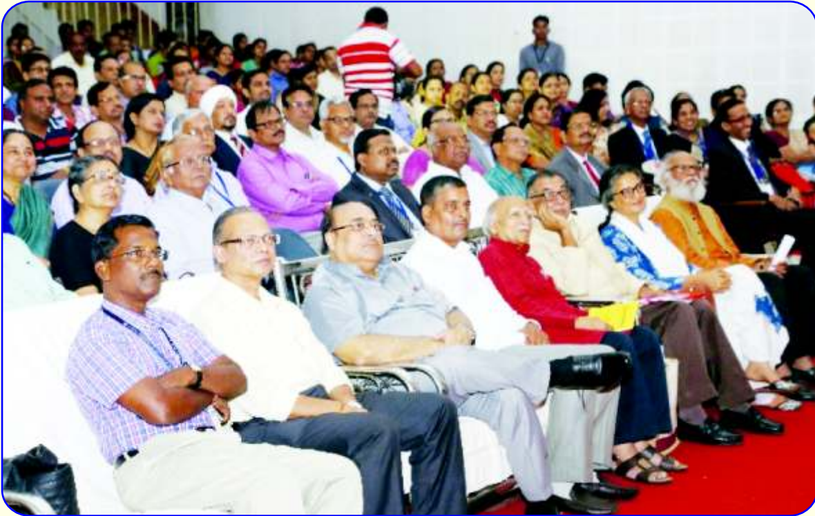
Distinguished Audience of the Kalinga Lanka Seminar

Scholars and representatives from prominent Universities and Institutions such as South Asian University, New Delhi; University of Kelaniya, Sri Lanka; University of Colombo, Sri Lanka; Utkal University, Bhubaneswar; Ravenshaw University, Cuttack; Odisha Institute for Maritime and South East Asian Studies (OIMSEAS); Department of Tourism & Culture, Govt of Odisha; National Institute of Fashion Technology (NIFT), Department of Handicraft, Handloom & Textile, Govt of Odisha; Delhi Institute of Heritage Research and Management and National Institute of Oceanography, Goa enriched the sessions through their expertise.