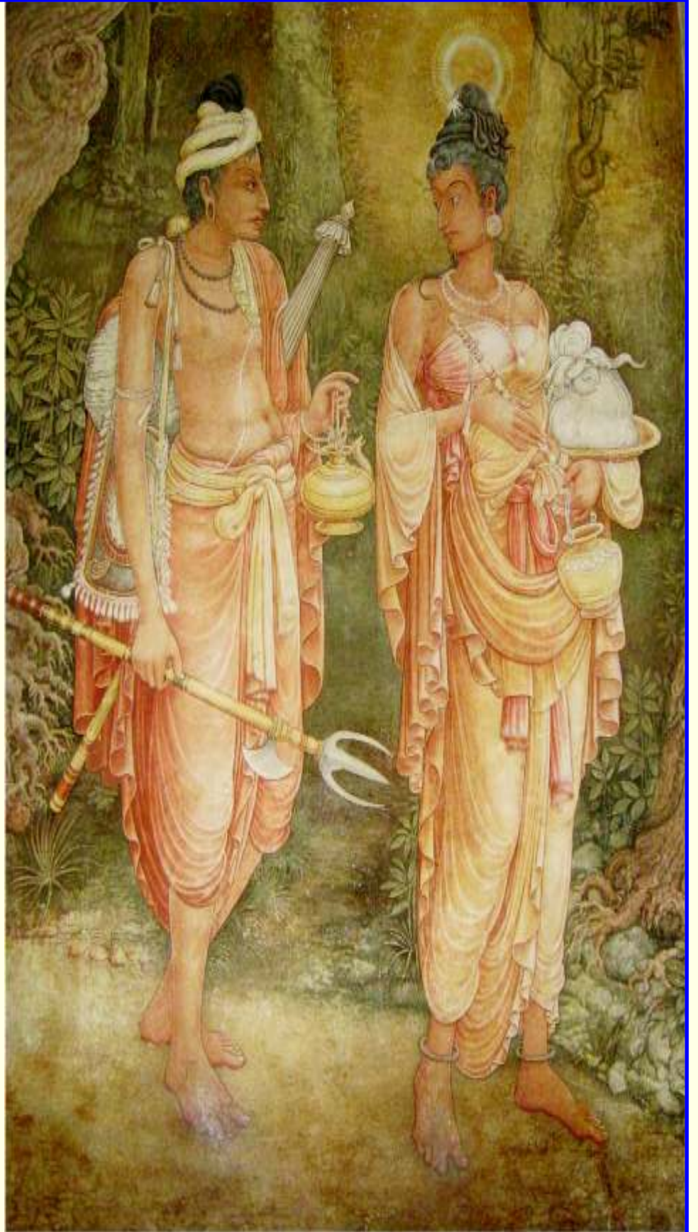
Princess Hemamala of Kalinga secretly carrying the Sacred Tooth Relic of Lord Buddha in her hairdo to Sri Lanka along with her husband Dantakumara. Both were in disguise.

Y-165, Regency Park-II, DLF Phase-4, Gurgaon-122009 www.kalingalankafoundation.org Email: kalingalankafoundation@gmail.com