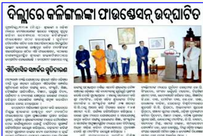
The Samaja, Odia Daily