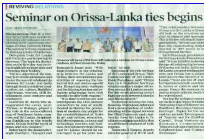
Odisha Post, leading English daily from Bhubaneswar