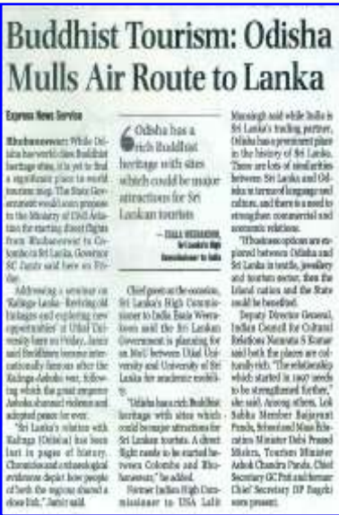
The New Indian Express